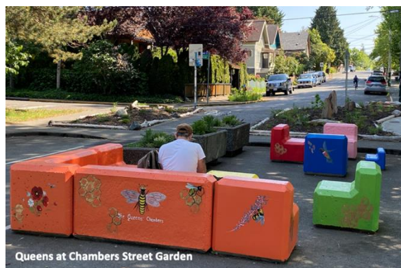
Queens at Chambers Street Garden

A few residents can do a lot to create amazing public spaces. Residents in Fernwood turned a boulevard area into something special for the neighbourhood. Through a My Great Neighborhood grant, they first transformed the grass boulevard into a garden of native plant species. The City contributed several surplus planters and some concrete furniture. Locals agreed on a placemaking layout that people would enjoy. The residents recently completed the final touches on the project with the painting of the furniture through another grant. It's now a popular place to sit and relax – a testament to its success!