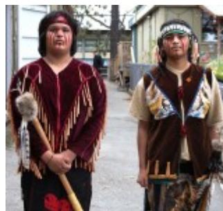
Esquimalt Nation Dancers