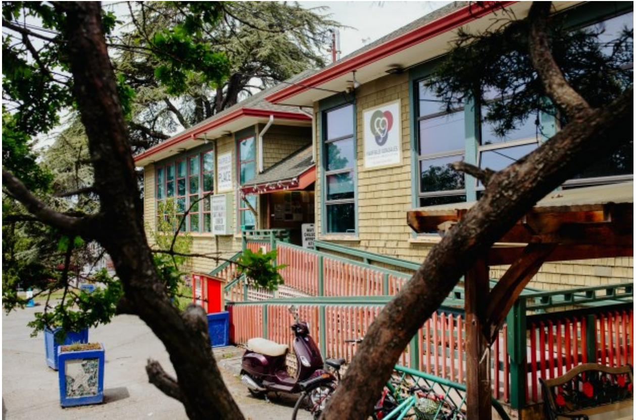
Fairfield Gonzales Community Association