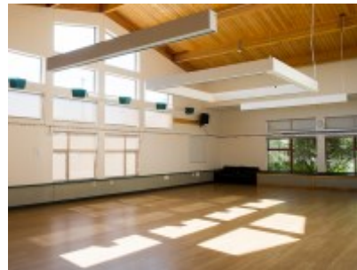
The Garry Oak Room

Facility rentals continued to increase as covid restrictions were removed. The association has found it challenging to meet the number of rental/booking requests during prime times on weekday evenings (Monday to Thursday 6pm-8pm) due to a lack of