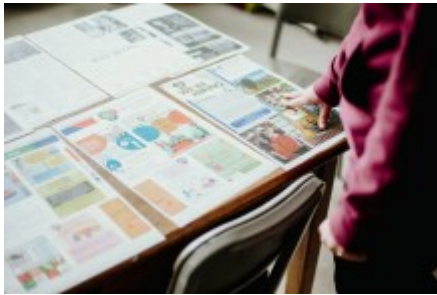
Proof Reading the Observer

The Fairfield Gonzales Observer Newspaper is our newspaper highlighting local stories, community partners, businesses and events. It also serves as a guide for all of the programs and services we offer at the FGCA.