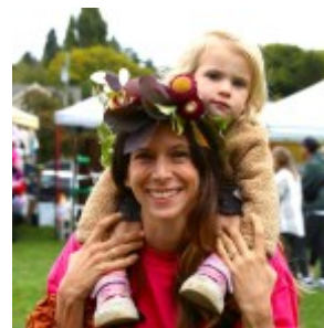
Fall Fairfield Participants

4 MUSIC AND DANCE PERFORMERS 23 CRAFT & FOOD VENDORS 1500+ ATTENDEES 15 VOLUNTEERS