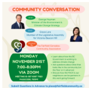
Community Conversations Advertisement