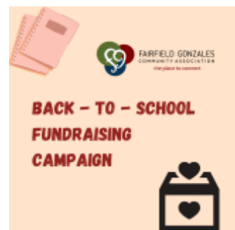
FGCA Back-To-School Fundraiser