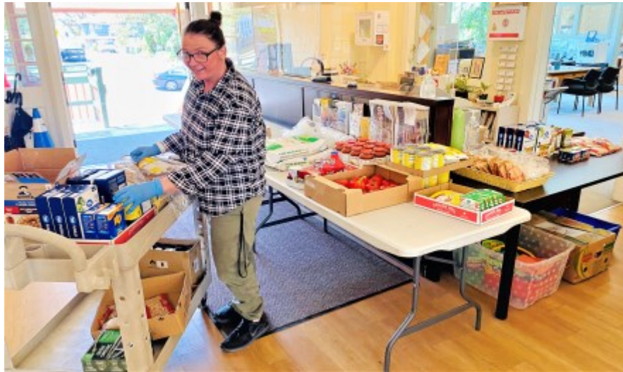
Thursday Food Pantry

Since its inception, we've continued to run our two weekly food programs, partnering with various non-profits, businesses, and the City of Victoria. Every week, rescued food, along with community donations get put into the hands of those who need it. Rescued & donated food comes from The Food Share Network, Starbucks, Coldstar, Gatton House Farm, and community members.