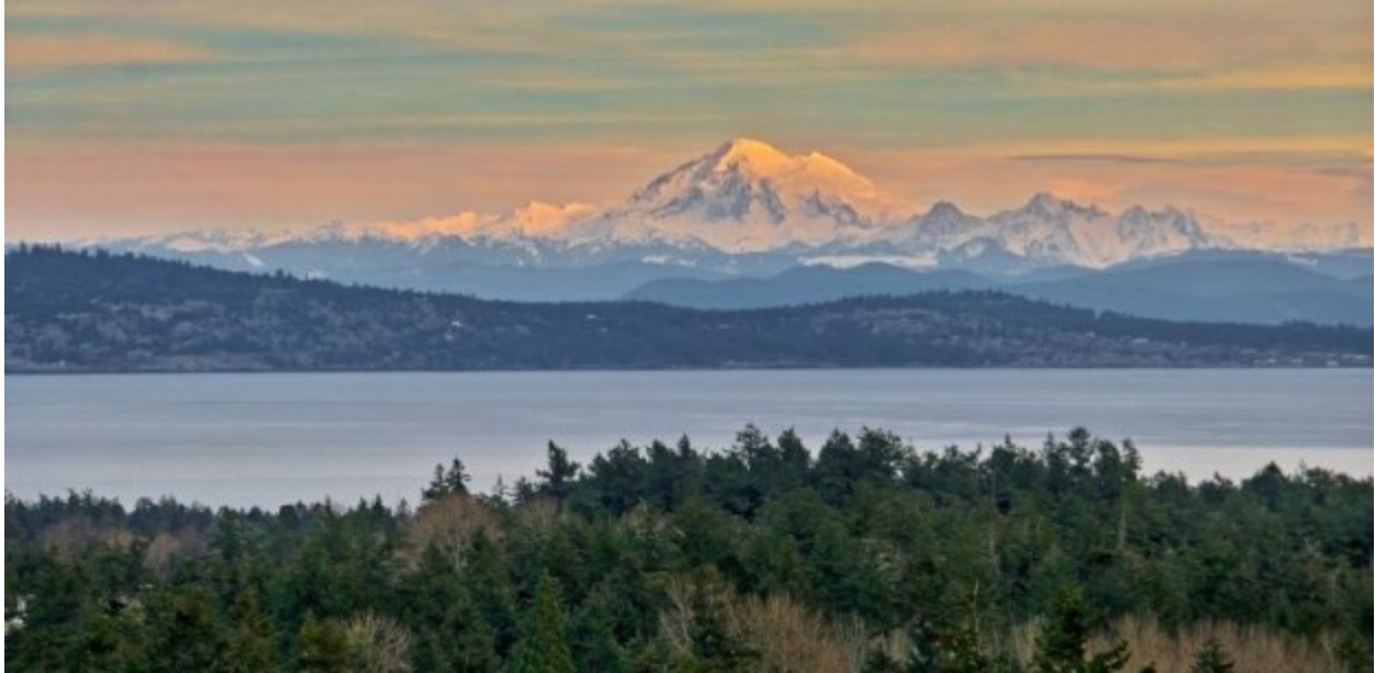
View of Mt Baker