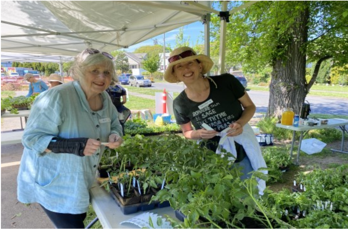
Get Growing, Victoria! Volunteers