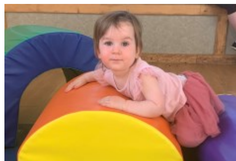
Family Drop-In Participant