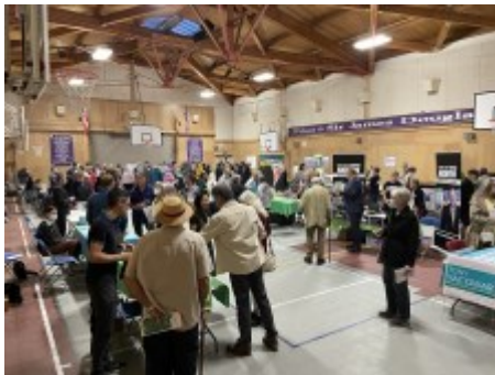
Municipal Candidates with Community Members

On September 15, 2022, we hosted an All-Candidates Forum for mayor and council candidates for the City of Victoria's October election. We used an open house format where each candidate hosted a table and attendees could connect directly with their municipal candidates. All 8 mayoral candidates and 37 council candidates were invited and a majority attended. Over a hundred community members came out to meet their candidates, and some stellar volunteers even made a 'candidate bingo' card to help people engage! We gave mayoral candidates the opportunity to speak for 5 minutes about their platform, which was also livestreamed on Youtube.