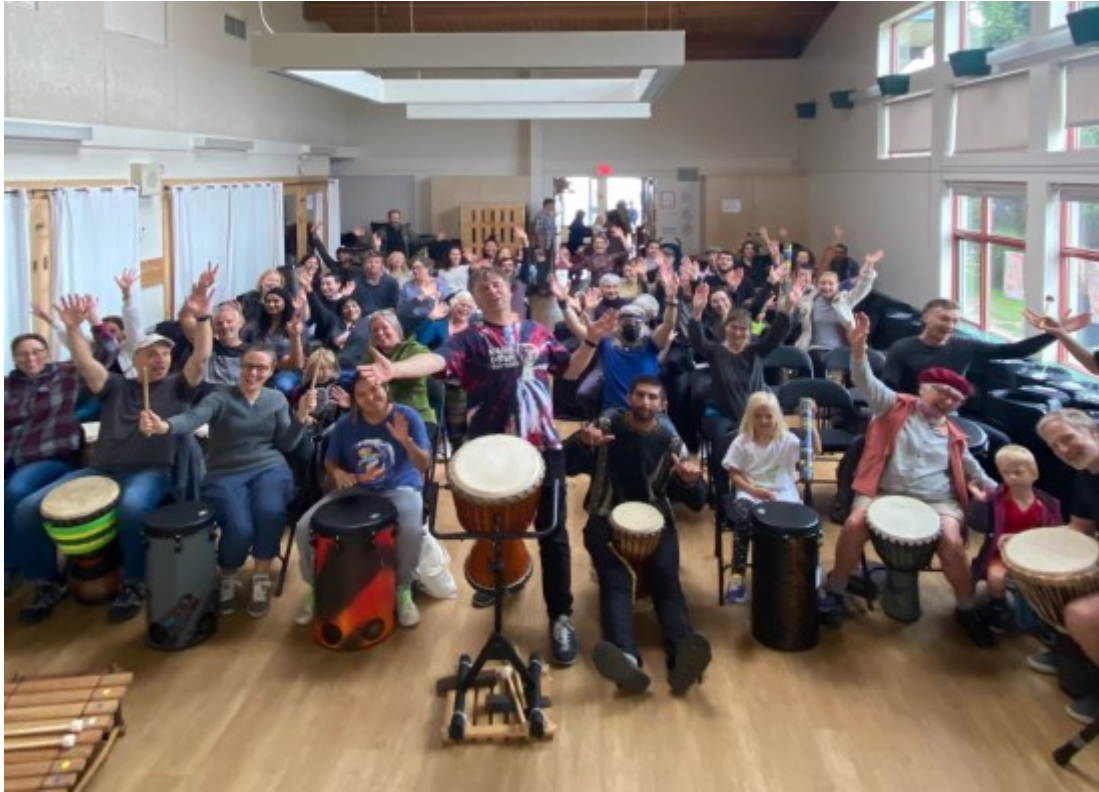
Djembe Drumming & Percussion