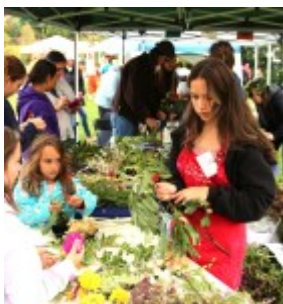
Harvest Hat Making

Every 3 rd weekend of September, we host our annual neighbourhood festival, Fall Fairfield. To quote one of the event participants, this year's Fall Fairfield was the best ever! 1500 community members gathered and celebrated the harvest season enjoying live performances, vendors, and activities. This was the first event that came back in full swing since the pandemic.