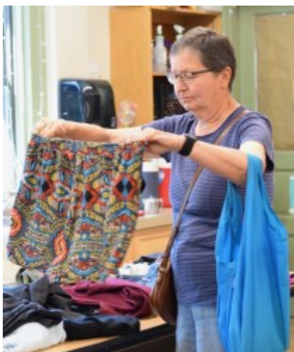
Clothing Swap Participant