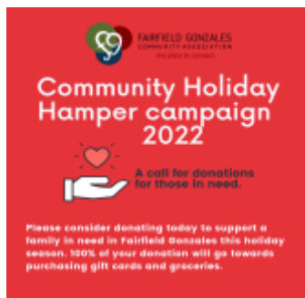
FGCA Holiday Fundraiser

For the 2 nd year, the FGCA supported families in need during the holiday season. We supported families with gift cards to help them afford food and gifts for their families during a time that presents additional financial burden. 18 community members and one local business (Paws on Cook) helped raise funds to help families have a happy and stress-free holiday! Many expressed, with emotion, being extremely grateful for the support, and how it would make a difference for them and their kids in these challenging times. Thank you for making this possible!