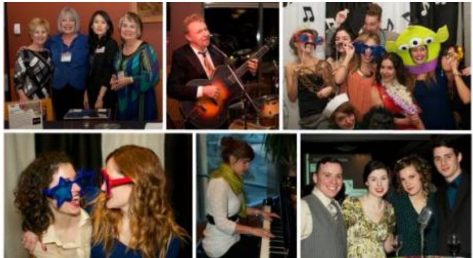
Jazz Gala: Spring Swing