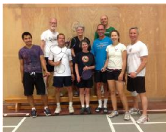
Drop-in Badminton regulars

Recreation at the FGCA has a range of classes for our community members. Our ever popular anchor classes; Zumba, Iyengar Yoga, and African Hand Drumming, which account for about 80% of program revenue, allow us to take a chance on new programming in an effort to support emerging instructors and bring something different to the neighbourhood.