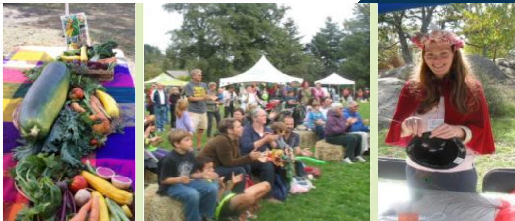
Fall Fairfield Harvest Fete

Our way of showing appreciation to our Out of School Care families; inviting them to share a barbeque, games and activities every June.