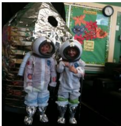
Five Points Preschool

Family programs at the Place offer a gateway into our community centre with young children attending with their primary daytime caregivers (parents, extended family, family friend or paid childminder). Our family programs operate for ten months a year, shadowing the school year calendar. Most of our programs are designed as day of drop in with no pre-registration. Our licensed Preschool, Fairfield Five Points, offers a "learning through play" program three mornings a week.