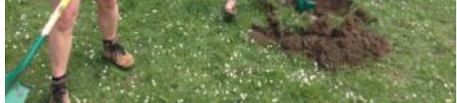
Community Garden ground breaking