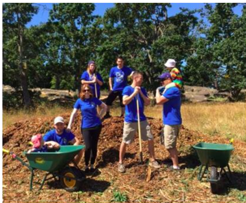
RBC Day of Service

Thrifty Foods RBC Cook Street Village ReFuse Level Ground Orca Books Knotty By Nature ...and many individuals who have donated craft supplies, books, dishes and more!