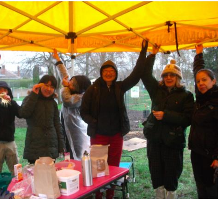
Rainy day garden work party