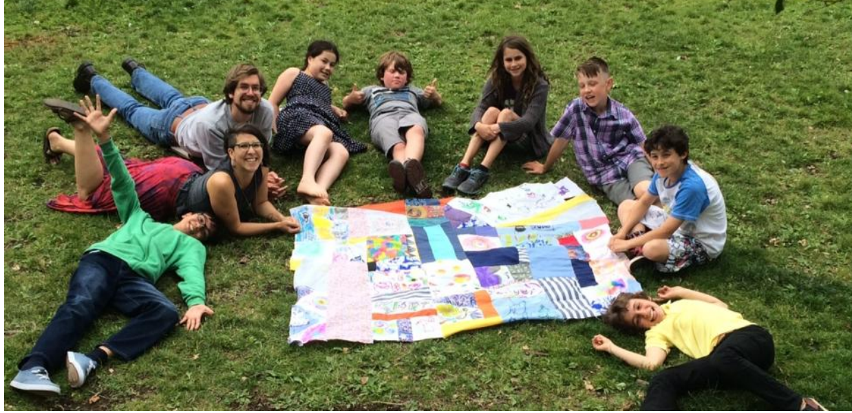
Everyone made a patch and helped sew our beautiful Youth Zone quilt