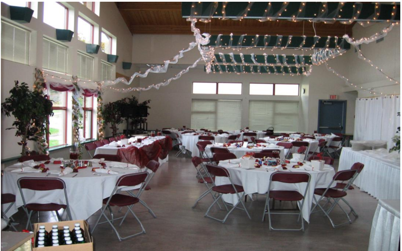
The Garry Oak Room , a popular place to rent