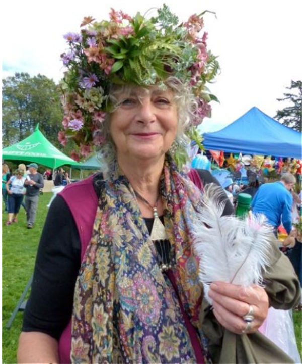
Harvest Hat at Fall Fairfield