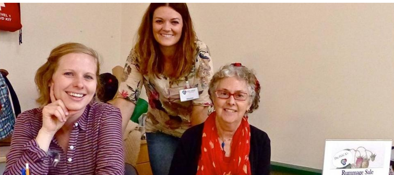
Staff and volunteers at the rummage sale fundraiser

Fairfield's third Community Wide Yard Sale hosted a whopping 63 sales this year, including large group sales at Fairfield United Church and St. Matthias church. We partnered again with the Salvation Army to pick up donations from households in the neighbourhood. We also added a fundraising component, a rummage sale that raised over $800 for the Fairfield Food Forest.