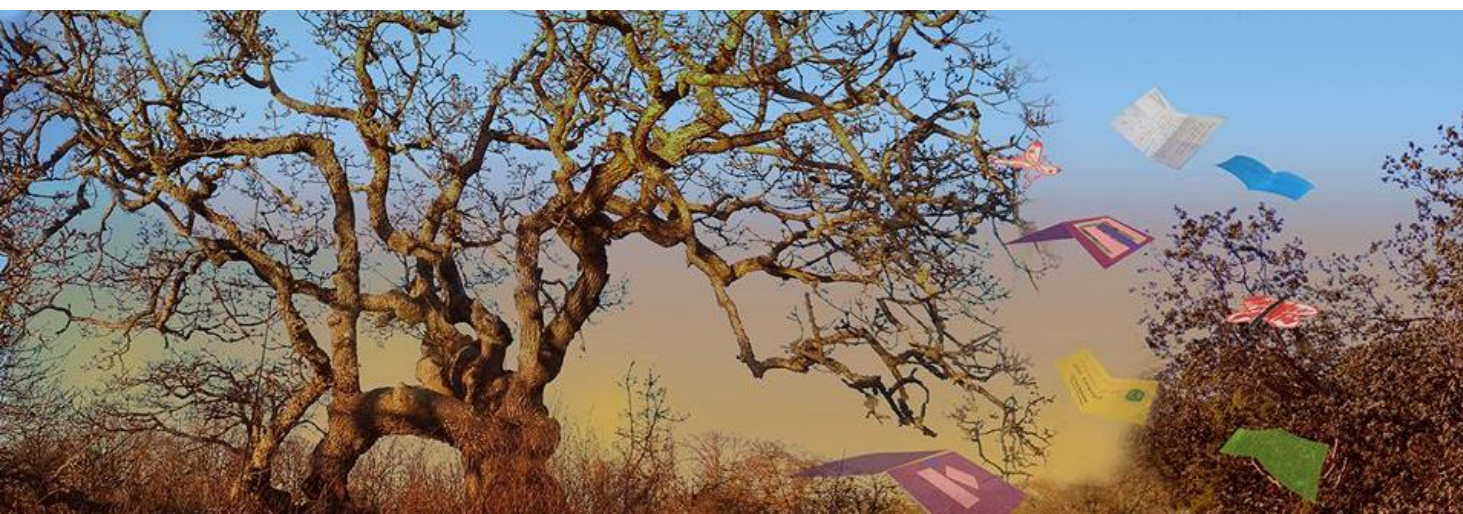
Detail from Fairfield Stories Community Mural, installed September 2015