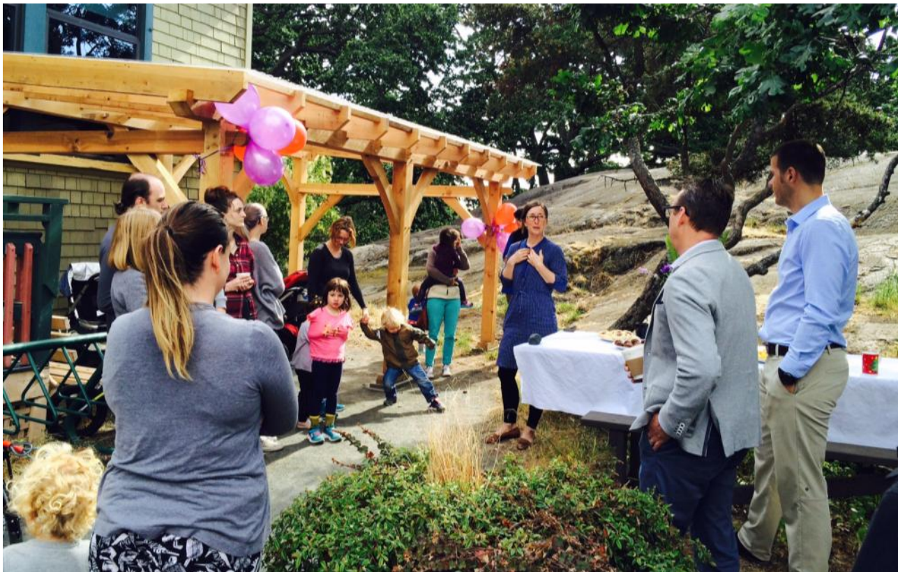
New stroller parking shelter celebration