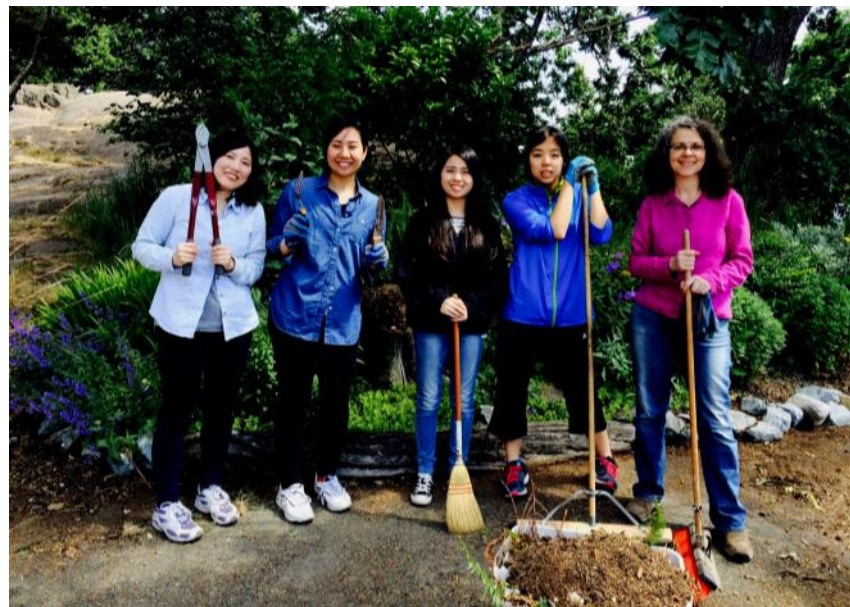
Stewart College Volunteers

Fairfield Community Garden Observer Newspaper Photography Board of Directors and committees Streetlife Committee Moss Street Market Booth Planning and Zoning Rummage Sale fundraiser Fall Fairfield Community Wide Yard Sale Youth Programs Out of School Care Newspaper delivery Postering and flyering Babywearers group