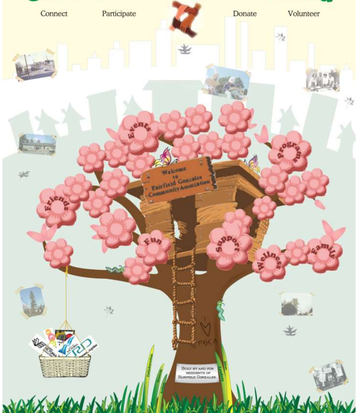
FGCA INFOGRAPHIC