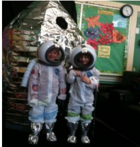
Five Points Preschool

Family programs at the Place offer a gateway into our community centre with young children attending with their primary daytime caregivers (parents, extended family, family friend or paid childminder). Our family programs operate for ten months a year, shadowing the school year calendar. Most of our programs are designed as day of drop in with no pre-registration. Our licensed Preschool, Fairfield Five Points, offers a "learning through play" program three mornings a week.