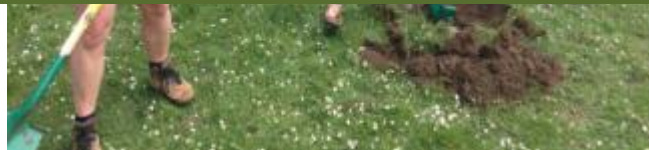
Community Garden ground breaking

Future plans include adding more trees and bushes next spring.