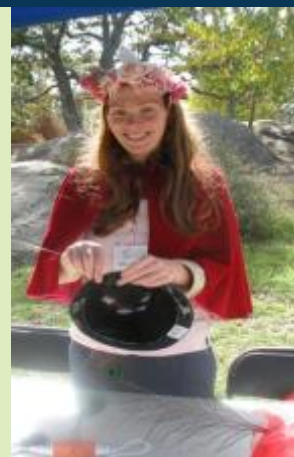
Fall Fairfield Harvest Fete