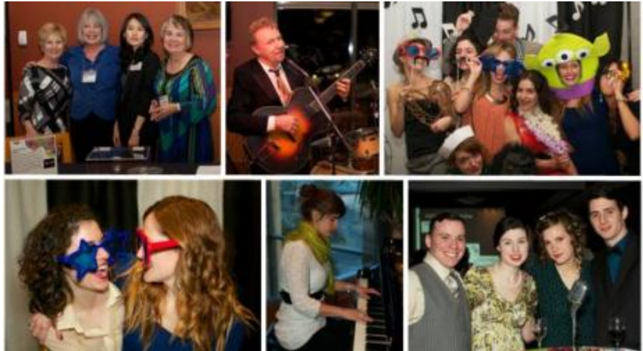
Jazz Gala: Spring Swing