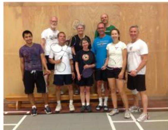
Drop-in Badminton regulars

Recreation at the FGCA has a range of classes for our community members. Our ever popular anchor classes; Zumba, Iyengar Yoga, and African Hand Drumming, which account for about 80% of program revenue, allow us to take a chance on new programming in an effort to support emerging instructors and bring something different to the neighbourhood.