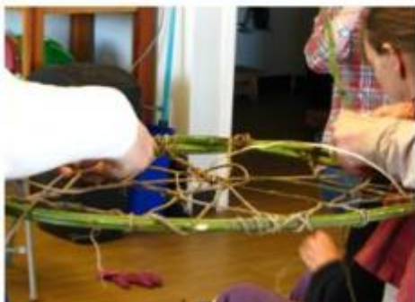
Through Fairfield Seasons

Audience reached: 2,242 Participants: 790 Volunteers: 55 Volunteer hours: 460