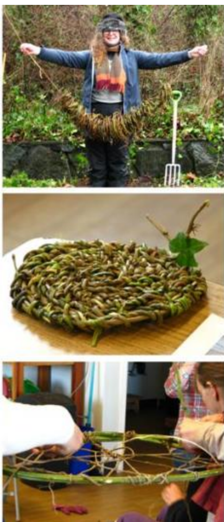
Through Fairfield Seasons