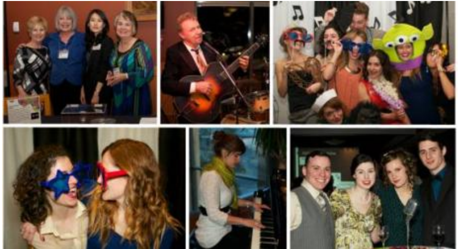
Jazz Gala: Spring Swing