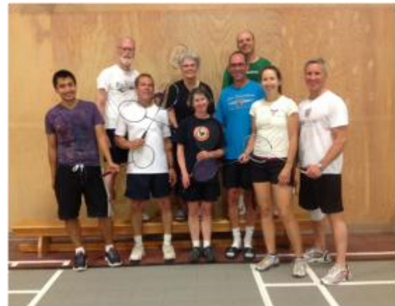
Drop-in Badminton regulars

Recreation at the FGCA has a range of classes for our community members. Our ever popular anchor classes; Zumba, Iyengar Yoga, and African Hand Drumming, which account for about 80% of program revenue, allow us to take a chance on new programming in an effort to support emerging instructors and bring something different to the neighbourhood.