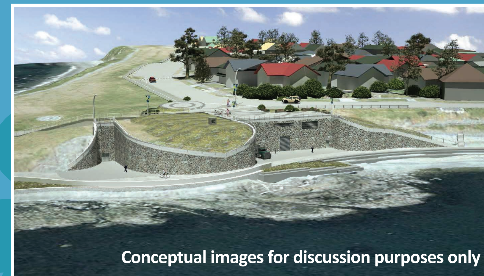
Conceptual images for discussion purposes only