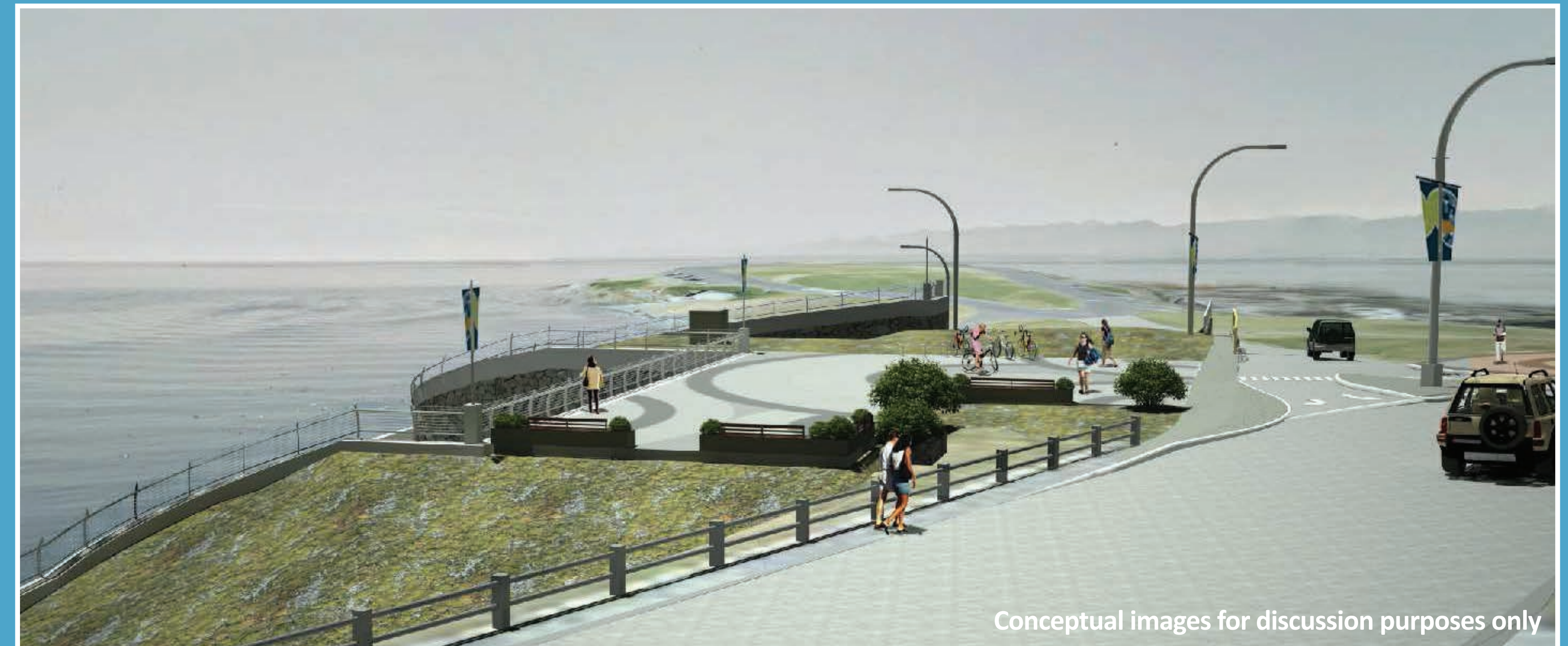
Conceptual images for discussion purposes only

Construction is anticipated to commence in 2017/2018. Further community updates will be provided.